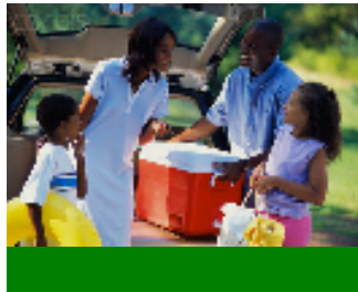
Picnics are a Great Way to have a Family Meal!

Do family meals really matter? Yes, they do! Studies show that mealtime conversation around the dinner table helps increase a child's vocabulary and this leads to better readers. Better readers do better in all subjects. Family meals help to strengthen families because it is a time for dialogue and sharing. They encourage a sense of belonging. Family meals help improve family communication. " What was your favorite part of the day? " is a question that can start the table talk. Mealtime is a perfect time for children to learn social skills, manners, and how to have pleasant conversations. Parents need to set a good example. Use the family meal time to teach children to take turns and be good listeners. Children learn to eat by watching others eat.